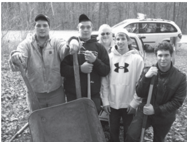
MUHS diversified education program spread gravel on the Means Woods part of the TAM November 18.