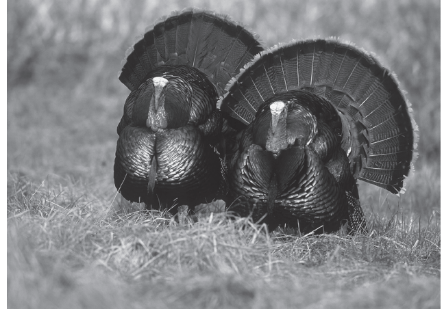
Eastern turkeys.

Saturday, December 10 Thursday, January 14 Saturday, February 9