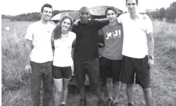
Middlebury College students working on a gravel project on the 97 trail, just before the Trek.

The TAM has had a lot of volunteer help this year from various groups. Kids from the Counseling Service school program widened the Wright Park part of the trail and will continue next season.